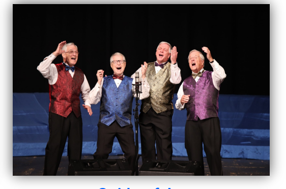
Quirks of Art 5th Place in the senior contest and 14th overall

Also representing our chapter in contest were: Miss Otis Regrets (11th Place), Breakfast Blend (19th Place), and Voices in My Head (23rd Place)