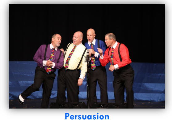
1st Place in the senior contest and 7th overall