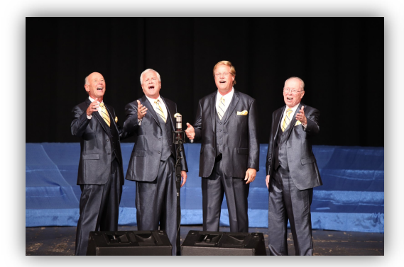
Silver Alert 3rd Place in the senior contest