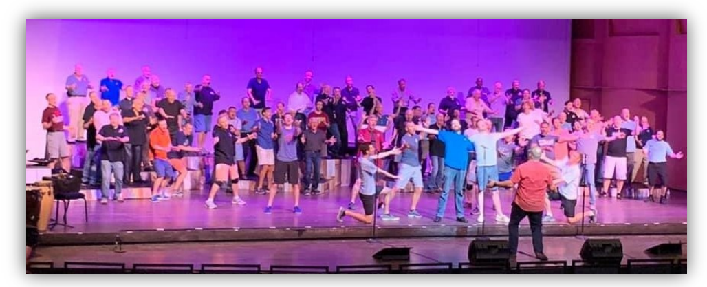
The Harmonizers—rehearsing before the show

own career in the arts and education. They have a shared repertoire with Instant Classic, so the audience was treated to several songs in beautiful 8-part counter-harmonies.